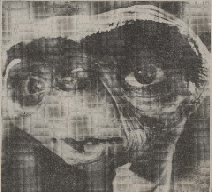
SCREEN ET... but readers claim they've met real aliens

"He was beside a pool containing a sick dolphin. He took my hand